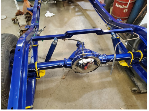
Chassis ready to mate with the body. Nice chassis & motor work!