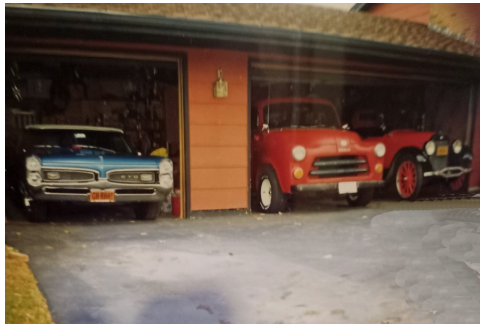
Greg's car corral including the GTO and Buick Roadster