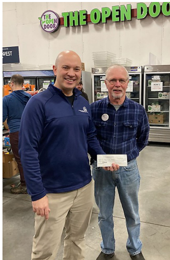
THE OPEN DOOR PANTRY