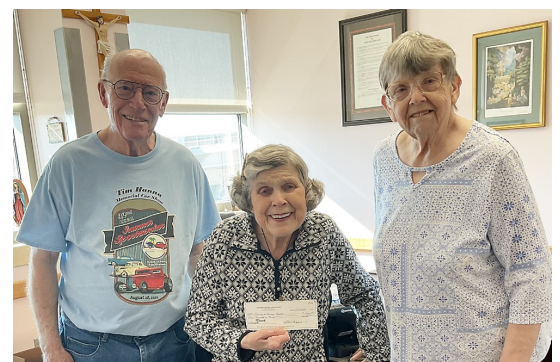
CARING & SHARING HANDS

Editor's note: In back of our group was a 1936 Plymouth Coupe, very apropos!