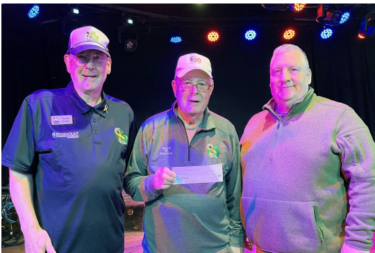
ROSEMOUNT BEYOND THE YELLOW RIBBON