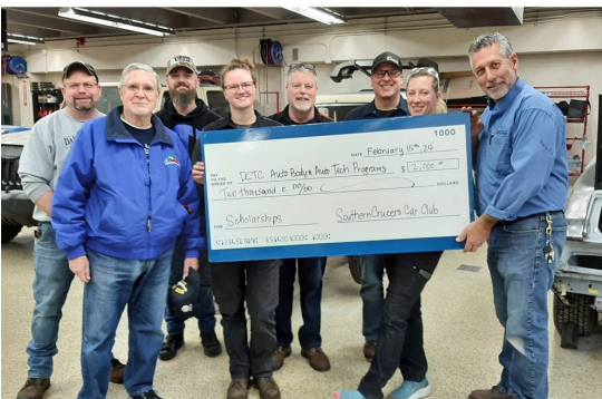
DAKOTA COUNTY TECHNICAL COLLEGE