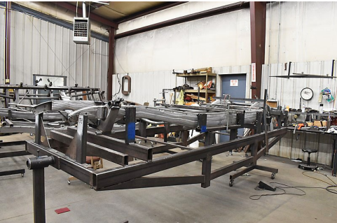
CHASSIS & AXLE SHOP