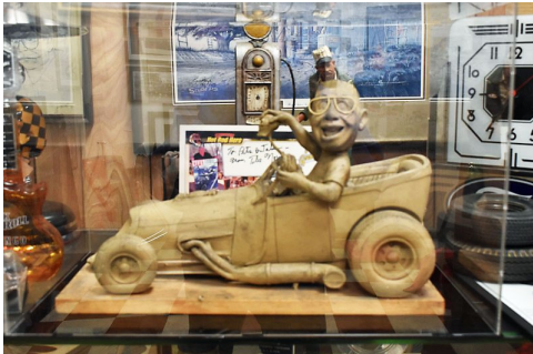
WOOD CARVING BY NORM GRABOWSKI (HE BUILT THE “KOOKIE CAR IN 1955)