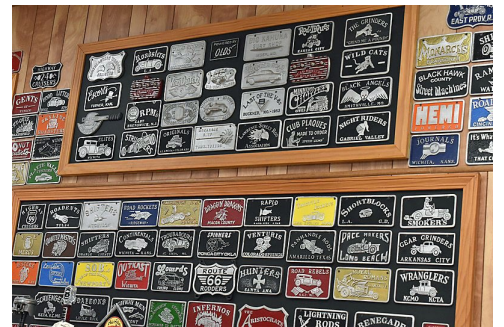
PART OF CLUB PLAQUE DISPLAY