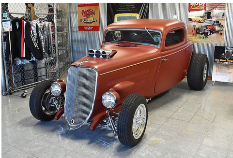
SUPER BELL AXLE COUPE