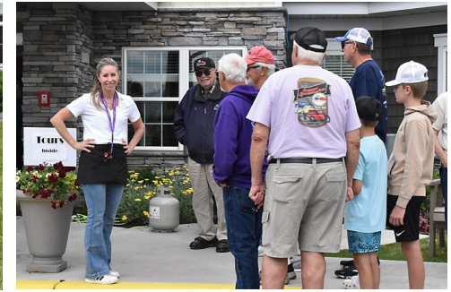
BODIN SENIOR LIVING, 6/19/24