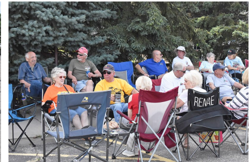
BUCK HILL SOUTHERN CRUZER NIGHT, 6/19/24