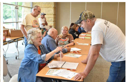
BACK TO THE FIFTIES SOUTH REGISTRATION, 6/20/24