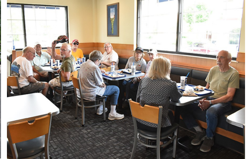
CULVER'S IN SAVAGE, 6/18/24