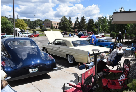
EBENEZER RIDGES, 25 CARS! A MINI-SHOW RECORD?