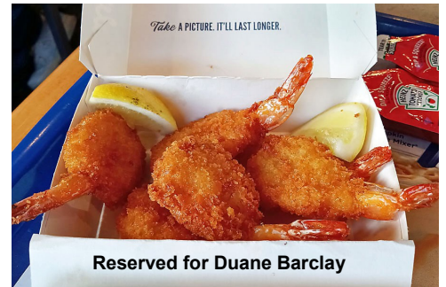
SAVAGE CULVER'S SHRIMP BASKET