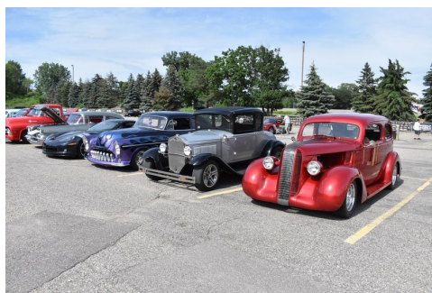
BUCK HILL "SOUTHERN CRUZER DAY"