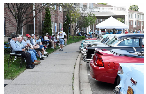
AUGUSTANA REGENT, BURNSVILLE