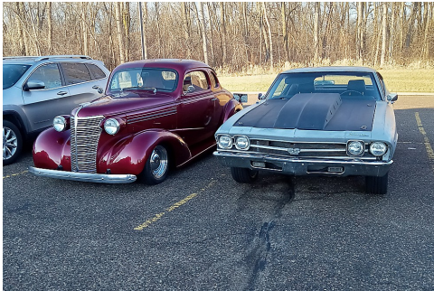
JANUARY 31, 2024