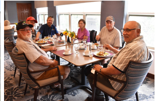
9 MILE CREEK SR. LIVING BEST LUNCH WE HAD?