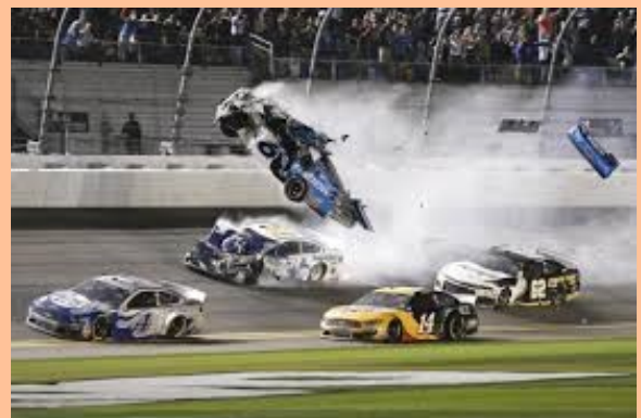
DAYTONA 500, FEBRUARY 16