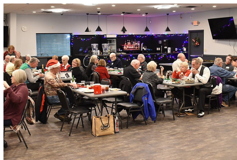
MORE OF THE FULL HOUSE