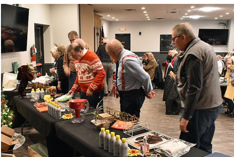
LOOKING FOR TREASURES