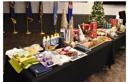
WHITE ELEPHANT GIFT TABLE